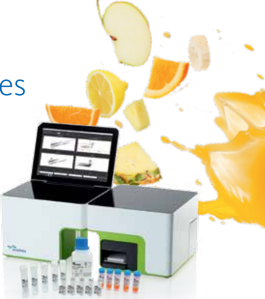
Cube 6 V2m with attached Robby 6 Auloloading Station and VitalCount kit